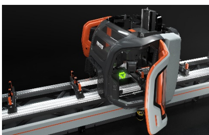
Laser scanner 05